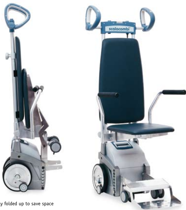
scalacombi: Easily folded up to save space

Thanks to short wheelbase and steerable front wheels it is very manoeuvrable and easy to steer particularly in small rooms or where the staircase is narrow.