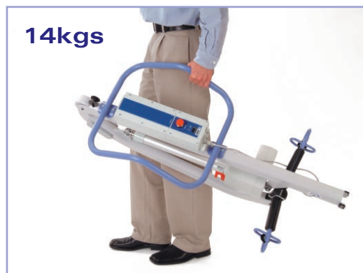
Mast and boom

In addition to outstanding performance, the Advance can also be folded or separated for onward transportation.